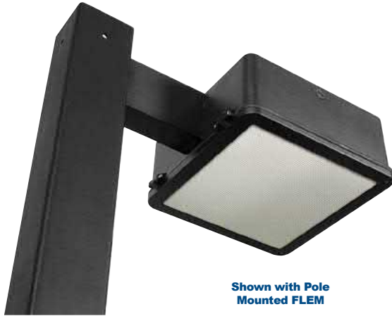
Shown with Pole Mounted FLEM