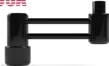
POST MOUNT PPMB14-SG-PM EPA: .7 WEIGHT: 65 lbs (max.)