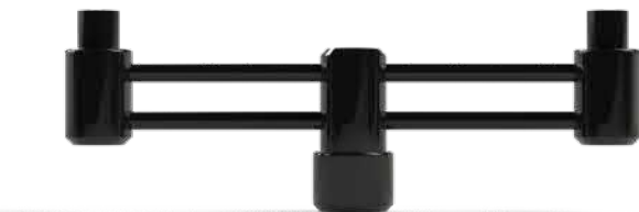
DOUBLE POST MOUNT PPMB-14-DB-PM EPA: .9 WEIGHT: 65 lbs per arm (max.)