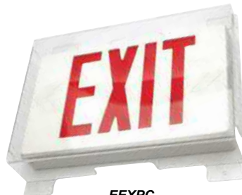
EEXPC (Shown Mounted)