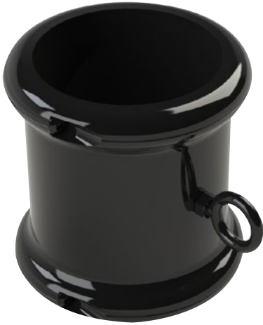
Eyebolt - Smooth