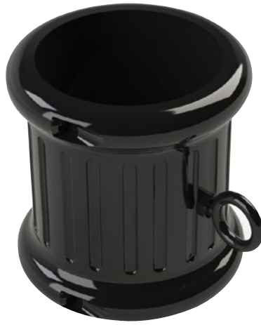
Eyebolt - Fluted